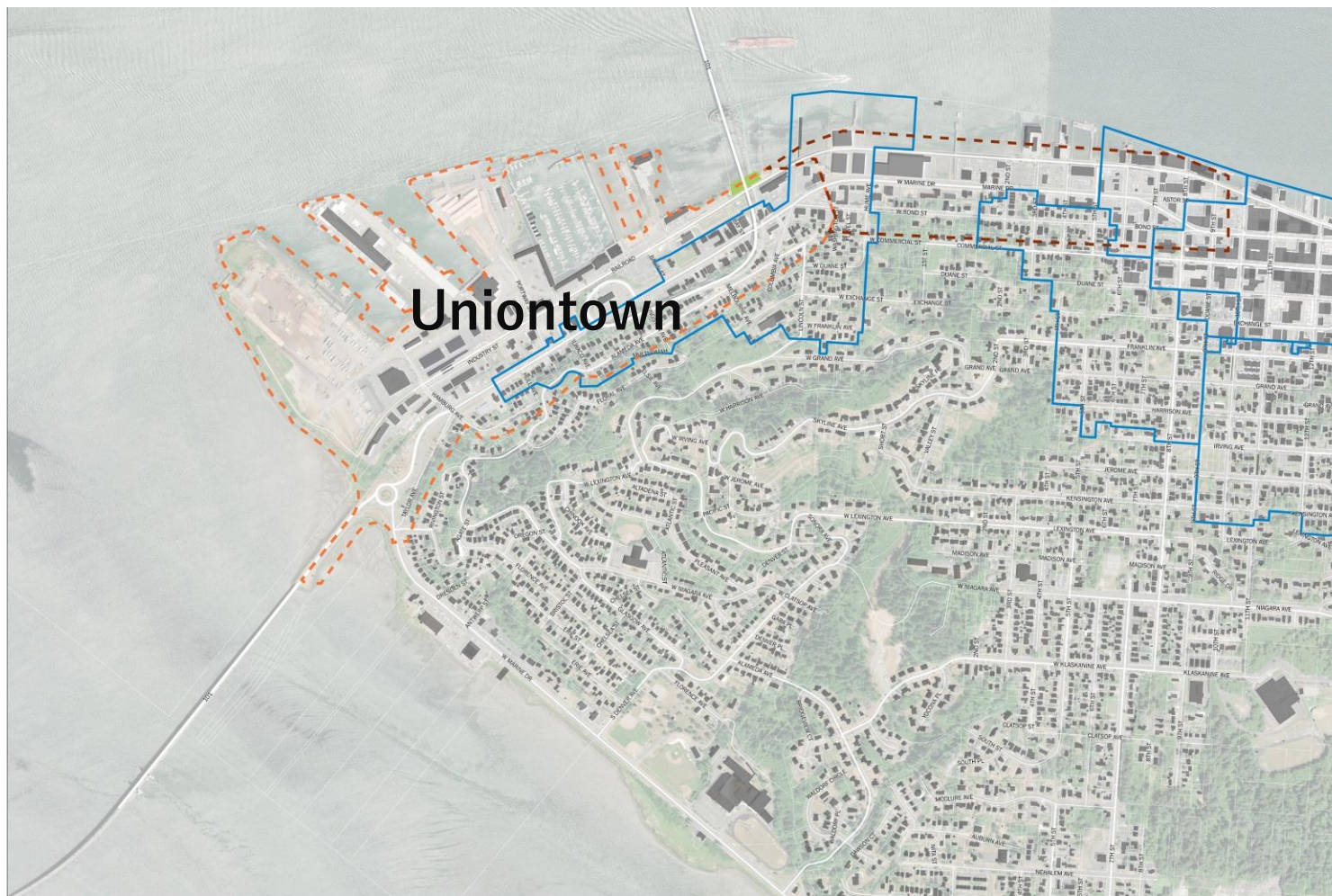
ASTORIA UNIONTOWN REBORN MASTER PLAN Study Area