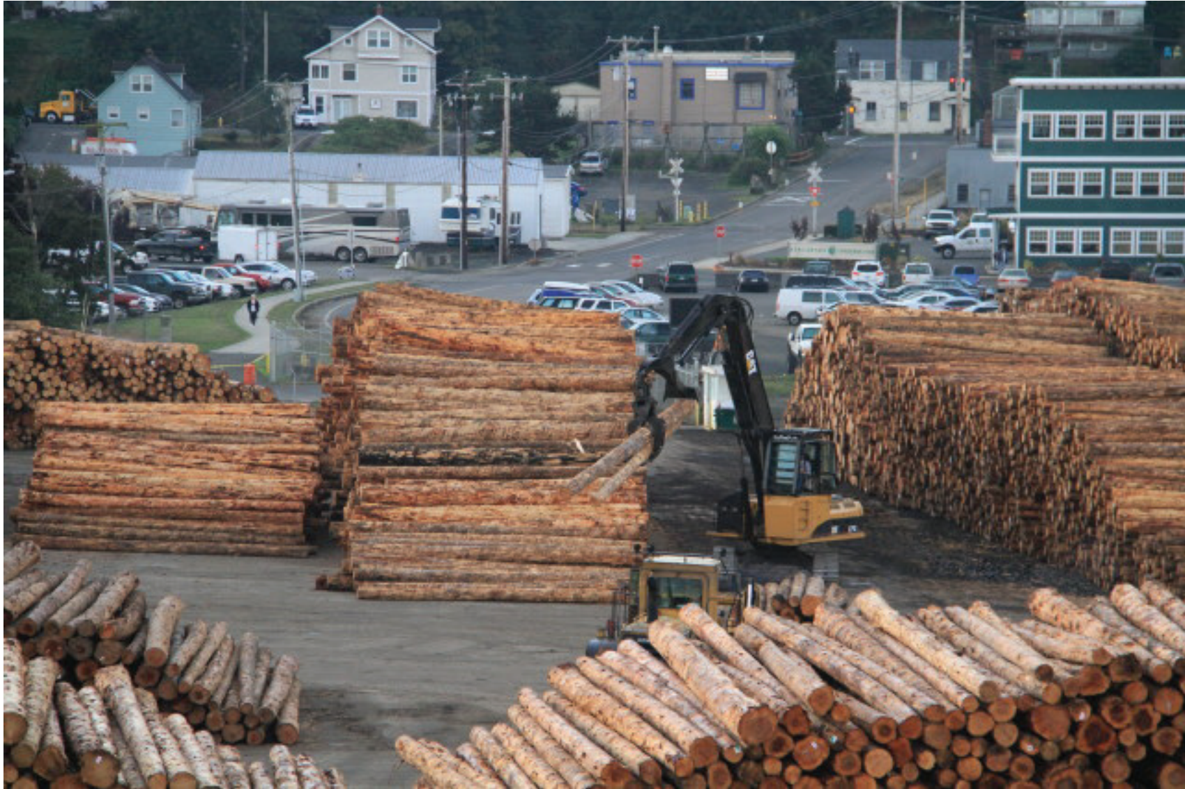
Stacking logs at the Port of Astoria-owned yard on Pier 3 in Uniontown