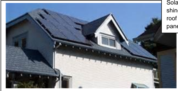
Solar roof shingles and roof mounted panels